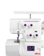
eXtend 264 Overlocker with 4/3 threads compact and essential.

A 5-year warranty is automatically included with our products and well demonstrates that we positively believe in their longevity.