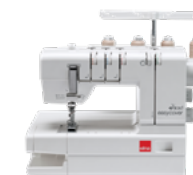
eXtend easycover Coverstitcher with 4/3/2 threads for cover and chain stitch.