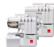
eXtend 664PRO & 664 Overlocker with 4/3 or 4/3/2 threads (PRO) for easy setting.