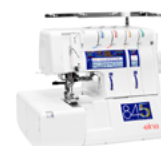
eXtend 845 Coverlocker with 5/4/3/2 threads and coverstitch plus automatic tension control.