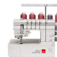
eXtend covermax Coverstitcher with 5/4/3/2 threads for top cover stitch additionally, with built-in spreader.