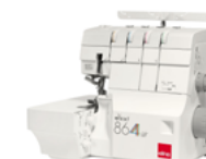
eXtend 864air Overlocker with 4/3/2 threads for easy threading