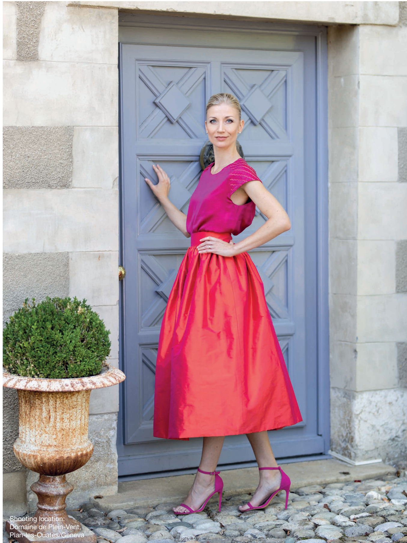
Shooting location: Domaine de Plein-Vent, Plan-les-Ouates/Geneva