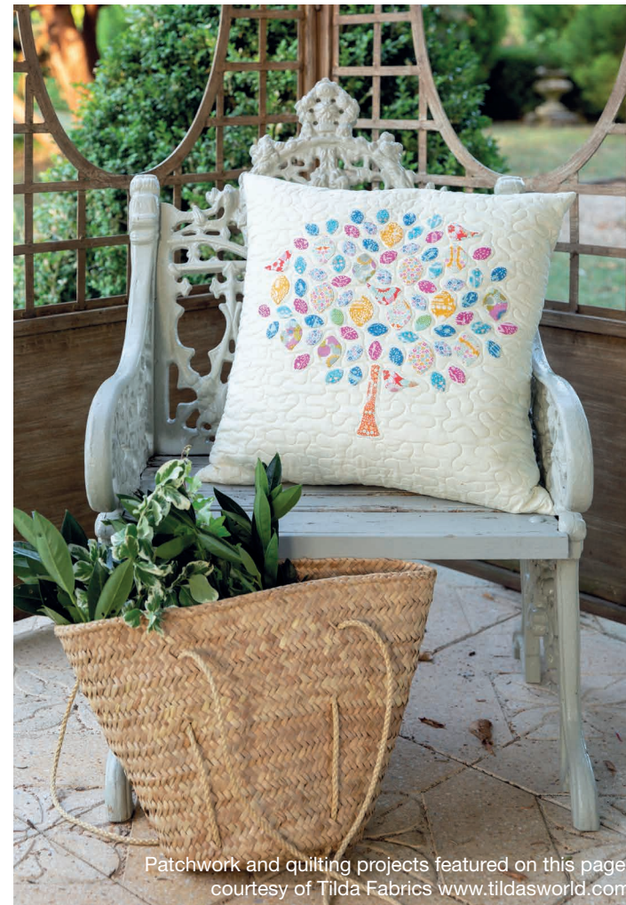
Patchwork and quilting projects featured on this page: courtesy of Tilda Fabrics www.tildasworld.com